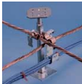
MBNUPCJ240 + CAT32HP (2" J-Hook)