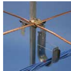
MBNUPCJ82 + CAT48HP (3" J-Hook)