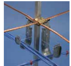
MBNUPCJ82 + CAT32HP (2" J-Hook) + CAT48HP (3" J-Hook)